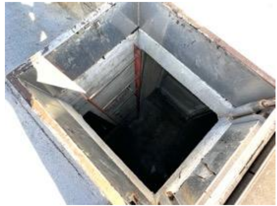
Reinforced concrete roof deck.