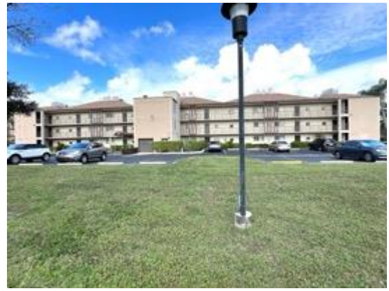
Building front view.