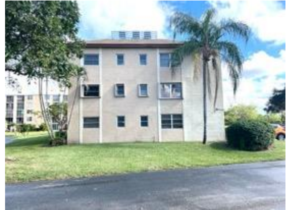
Building left side view.