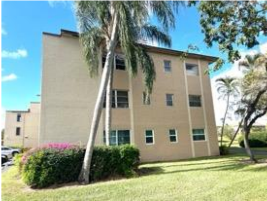
Building right side view.