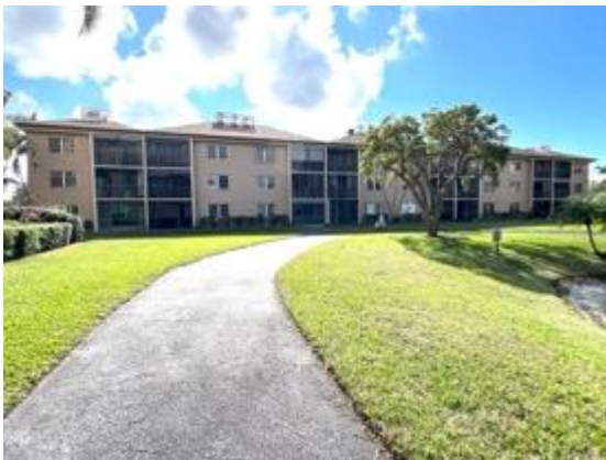
Building rear view.