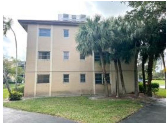
Building left side view.