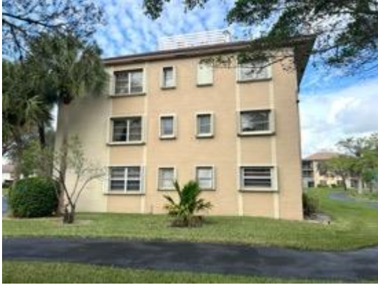
Building right side view.