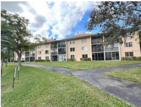
Building rear view.