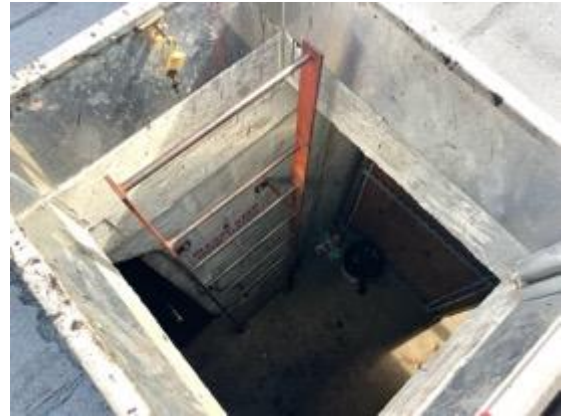
Reinforced concrete roof deck.