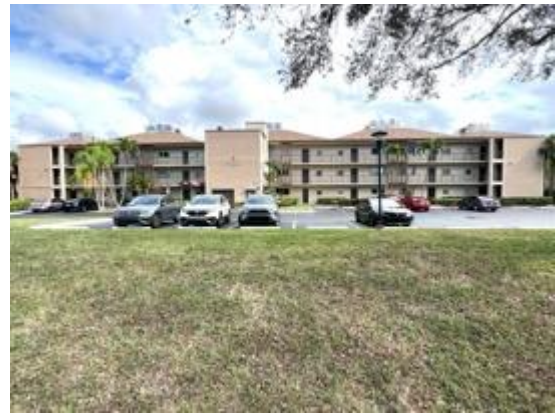
Building front view.